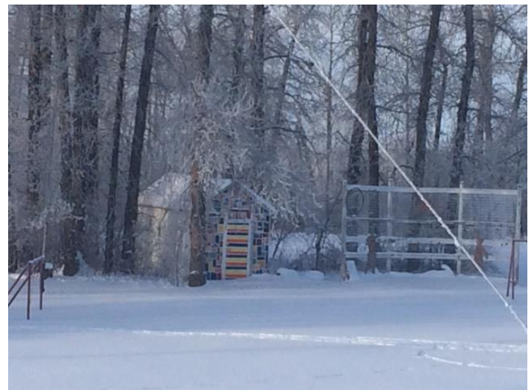
The Frosty Flats

"Surely I am with you always, to the very end of the age." ~Jesus Christ (mt 28:20)