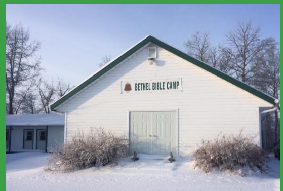
A sneak peek at what Bethel looks like in the winter.